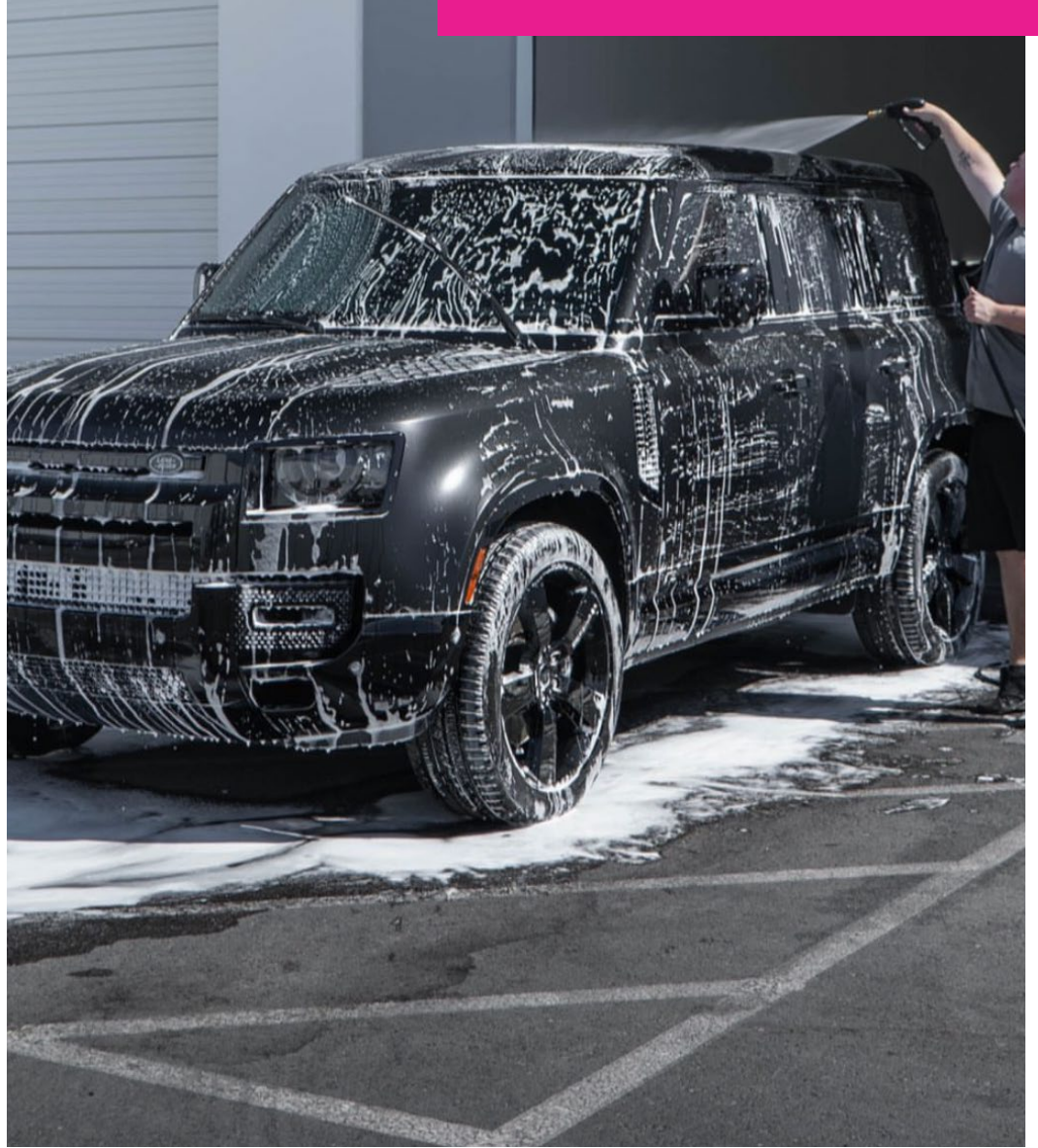
*Visit ceramicpro.com/shop to purchase recommended products